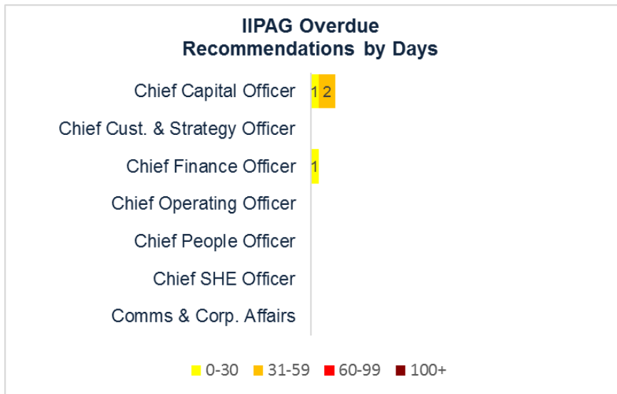
Figure 3: Overdue IIPAG Recommendations

5.2 The following graphs show the length of time that the overdue Project Assurance and IIPAG recommendations have been overdue by, as at the end of Period 10, and the Chief Officer area responsible for addressing the recommendations.