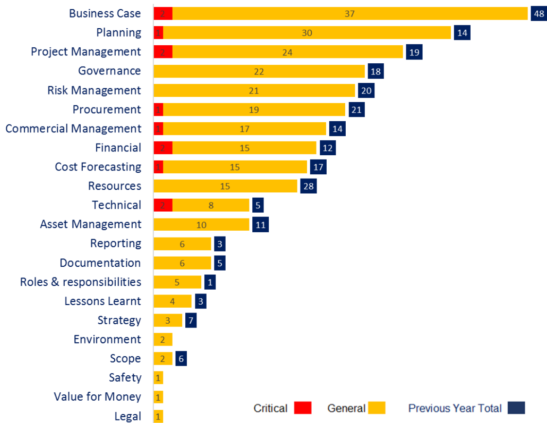
Figure 5: Project Assurance Recommendations by Topic (Totals over last four quarters versus previous year)

5.3 The following graph shows the number of recommendations made over the last four quarters grouped by recommendation topic. This is shown against the number of recommendations made in the previous year.