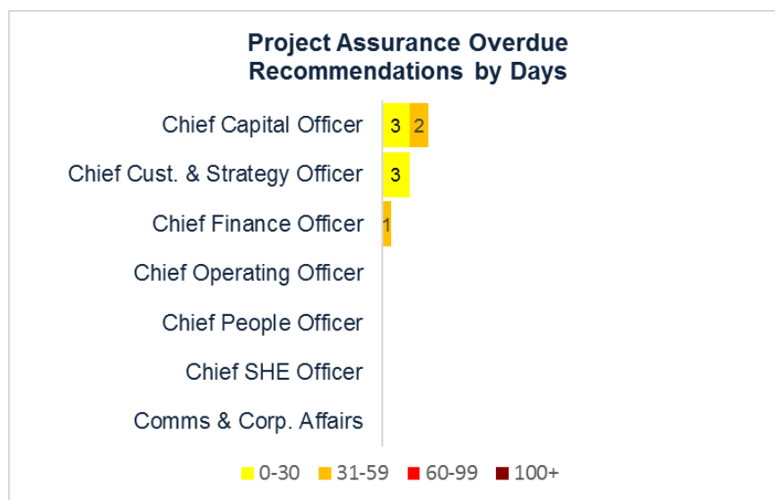
Figure 4: Overdue Project Assurance Recommendations